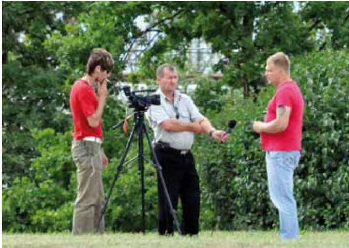
A film crew from Russia 24 embracing Nochnoi Dozor activists