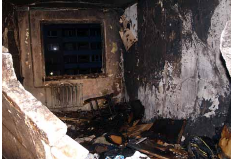
The consequences of the explosion on Kuldnoka Street in Tallinn

a counterterrorism exercise called Cruise Ship 2010. Special forces practiced landing onto a moving ship from an aircraft and vessel, taking control of the ship and its communications, defusing explosive ordnances, freeing hostages and other tactical activities.