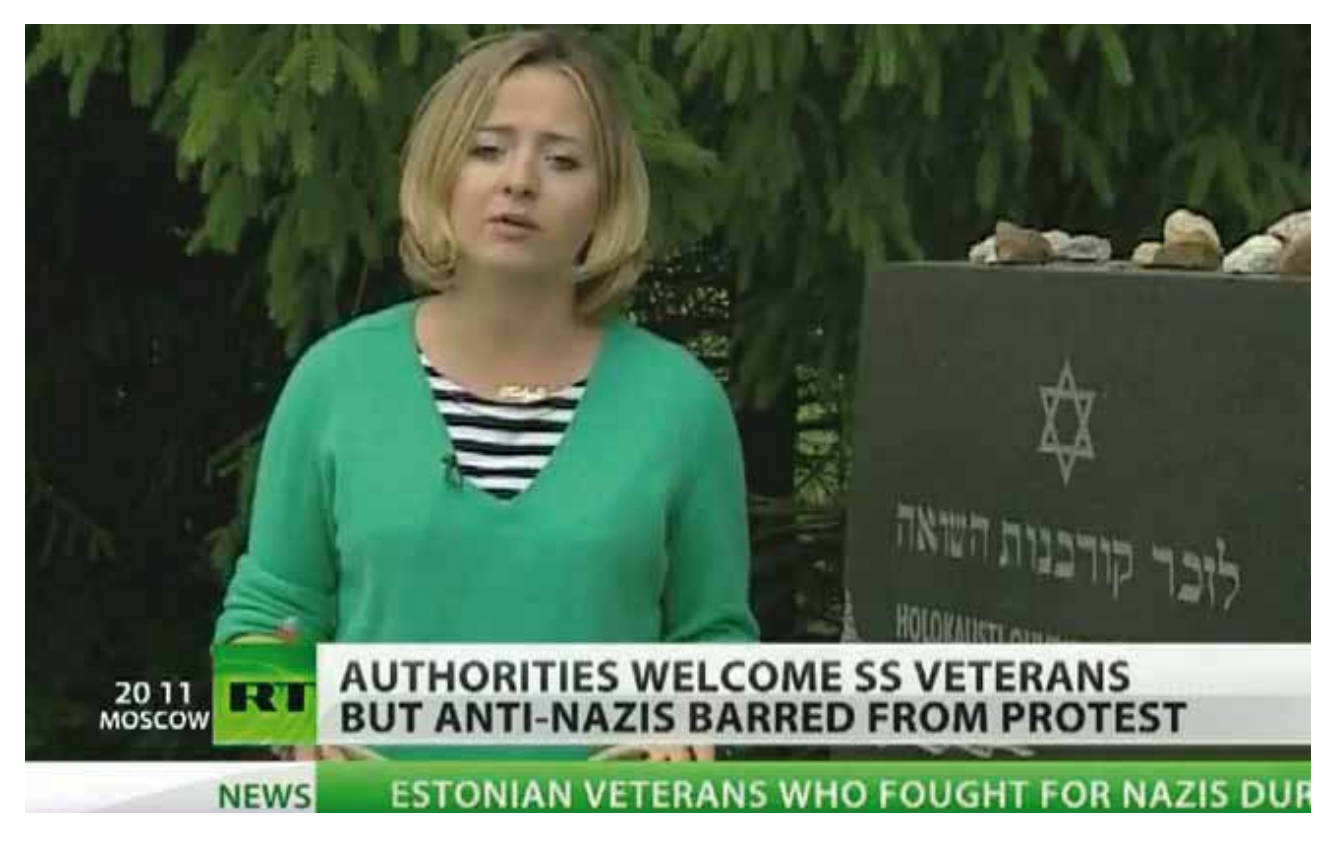
Russia Today journalist covering the commemoration of the battles at Sinimäed Hills

The Bronze Soldier can no longer be used as a source of conflict and, therefore, Russia is trying to find a new irritant, in order to bolster the myth of the Soviet Union as a liberator and to portray resistance to the occupation as a manifestation of nazism. For the past 17 years, commemorative events attended by former World War II soldiers who fought on the front have taken place in Virumaa. The events are similar to those that take place elsewhere in the world. In 2010, Russian media representatives were more numerous at Sinimäed Hills than in previous years. They portrayed what was a peaceful gathering without any disturbances, as the manifestation of a new wave of state-sanctioned nazism in Estonia and as a radical attempt at reevaluating history. Later many additional news stories portraying Estonia as a Nazi state were aired. Unfortunately, local media helped to significantly amplify Russia's message