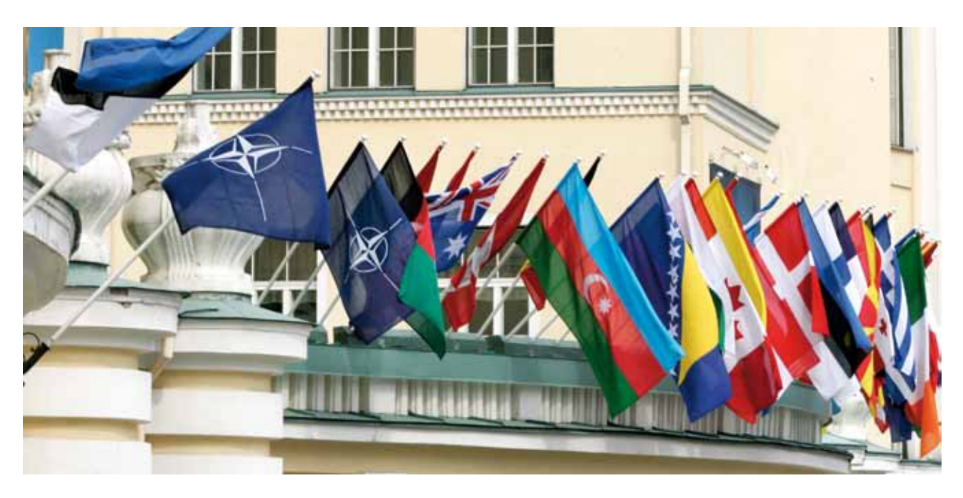
The informal meeting of NATO Foreign Ministers in Tallinn on 22-23 April 2010