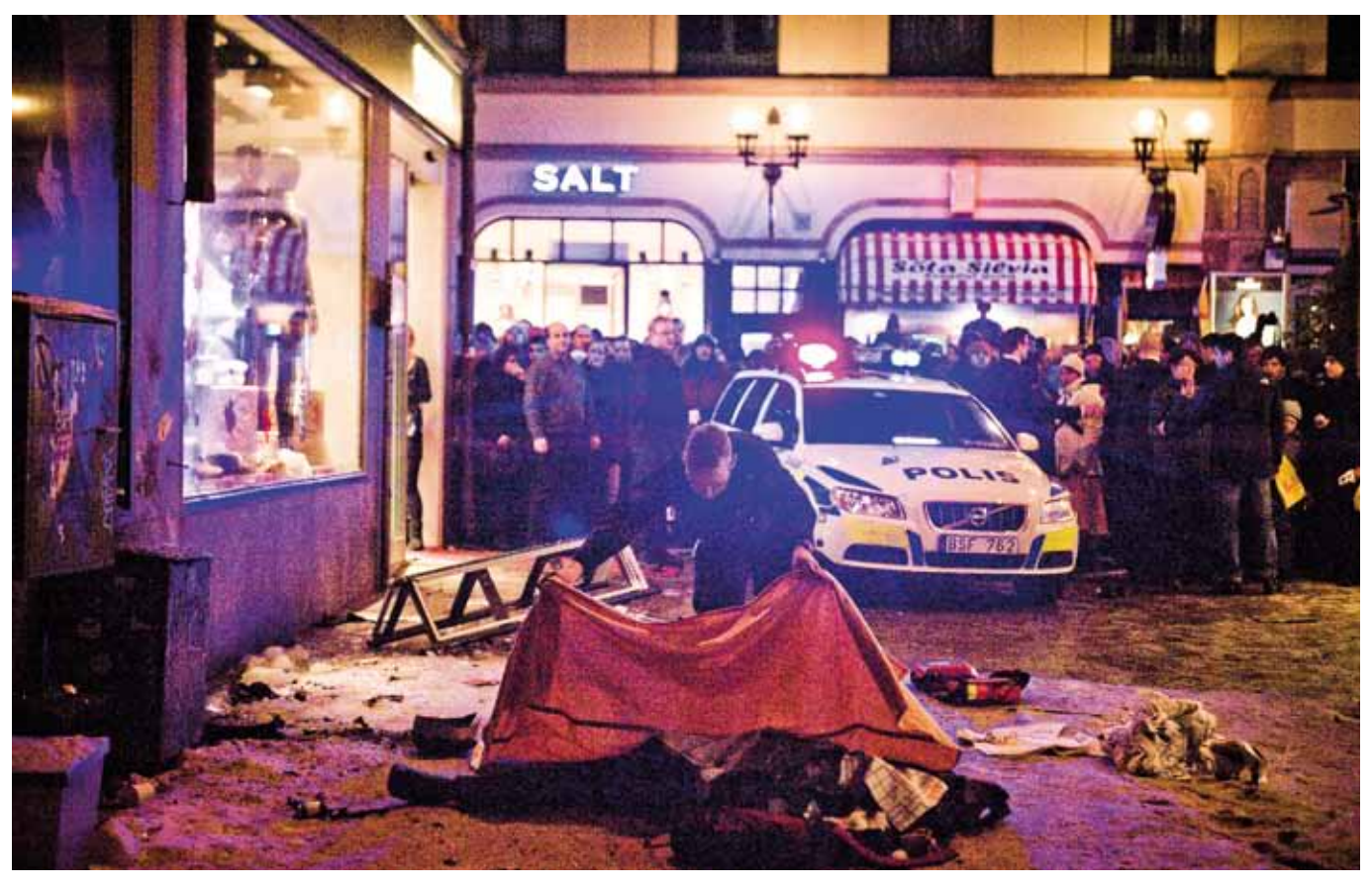
Terrorism is not remote. Terrorist attack in Stockholm in 2010