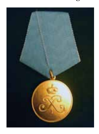
Medal commemorating the 300th anniversary of the uniting of Livonia and Estonia with Russia