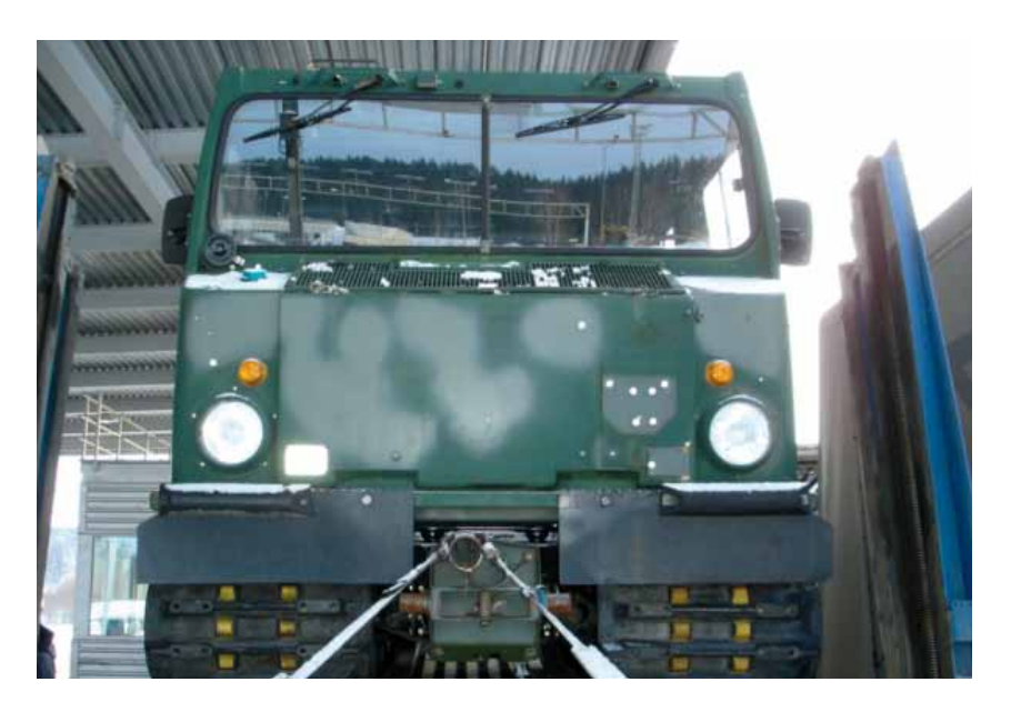
A BV 206 all terrain carrier that was attempted to transport from Sweden to Russia via Estonia

6 mortar simulators, 2 machine gun simulators ning 3 three fire controller's and battle simulators whose special export permits had expired (1 case).